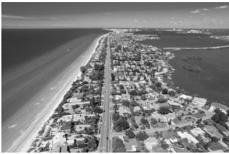
Pre-Approval App (W/O Subst Non-Substantial Damage Letter