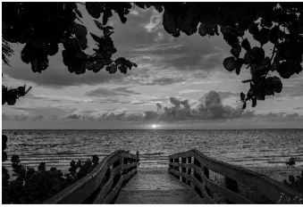
Resident's Guide to Rebuilding

Additional Hurricane resources can be found on the City Website HTTPS://www.indian-rocks-beach.com/hurricane-resources/