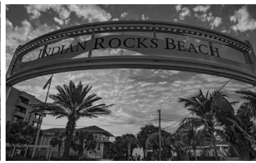
Pre-approval application (With Non-Substantial Damage Letter