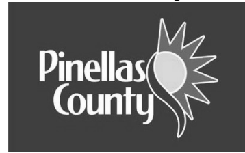
Pinellas Co Required Forms

City of Indian Rocks Beach Ph: 727/595-2517 City Hall www.indian-rocks-beach.com www.facebook.com/City-of-Indian-Rocks-Beach “Working Together”