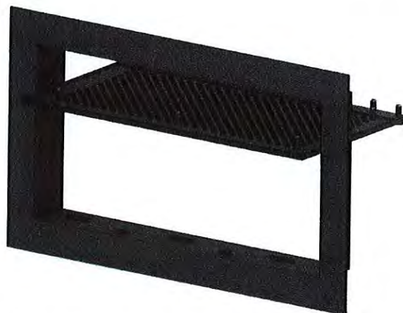
FIGURE 2—MODEL FFV-1608 FREEDOM FLOOD VENT®: SHOWN WITH FLOOD DOOR PIVOTED OPEN