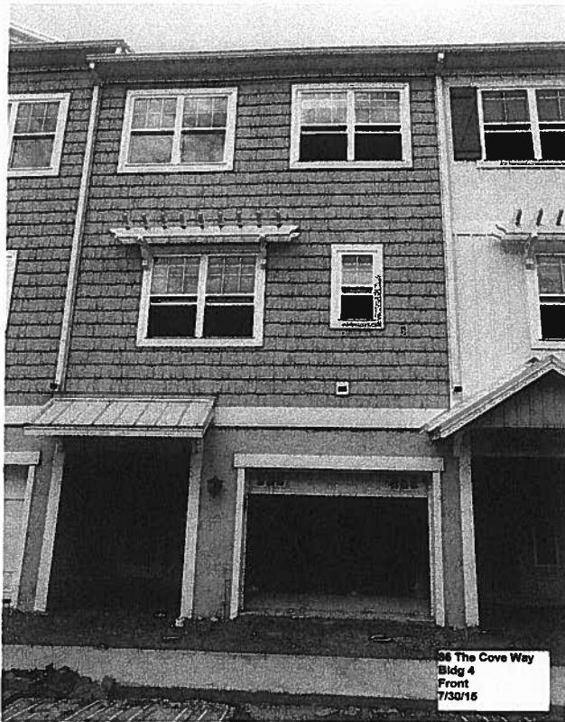
86 The Cove Way Bldg 4 Front 7/30/16

If using the Elevation Certificate to obtain NFIP flood insurance, affix at least 2 building photographs below according to the instructions for Item A6. Identify all photographs with date taken; "Front View" and "Rear View"; and, if required, "Right Side View" and "Left Side View." When applicable, photographs must show the foundation with representative examples of the flood openings or vents, as indicated in Section A8. If submitting more photographs than will fit on this page, use the Continuation Page.