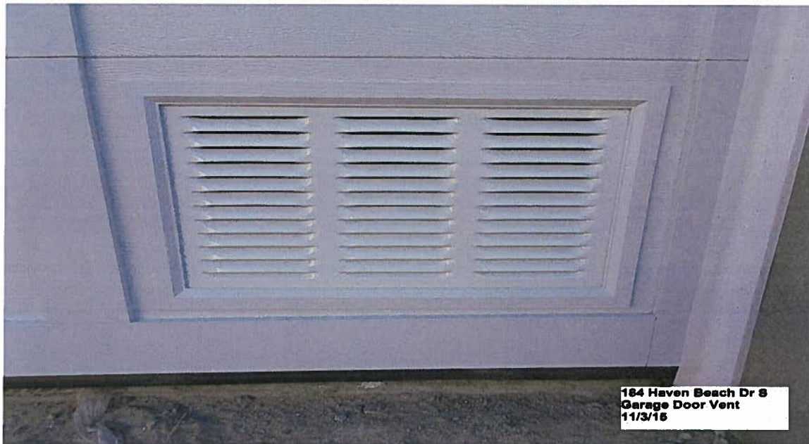
184 Haven Beach Dr S Garage Door Vent 11/3/15

If submitting more photographs than will fit on the preceding page, affix the additional photographs below. Identify all photographs with: date taken; "Front View" and "Rear View"; and, if required, "Right Side View" and "Left Side View." When applicable, photographs must show the foundation with representative examples of the flood openings or vents, as indicated in Section A8.