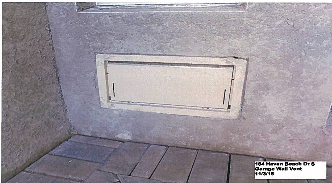
184 Haven Beach Dr S Garage Wall Vent 11/3/15