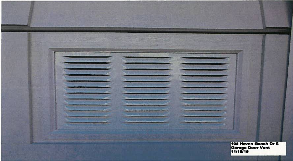
192 Haven Beach Dr S Garage Door Vent 11/16/15

If submitting more photographs than will fit on the preceding page, affix the additional photographs below. Identify all photographs with: date taken; "Front View" and "Rear View"; and, if required, "Right Side View" and "Left Side View." When applicable, photographs must show the foundation with representative examples of the flood openings or vents, as indicated in Section A8.