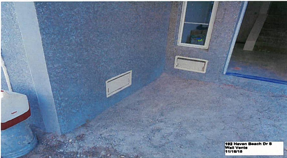
192 Haven Beach Dr S Wall Vents 11/16/15