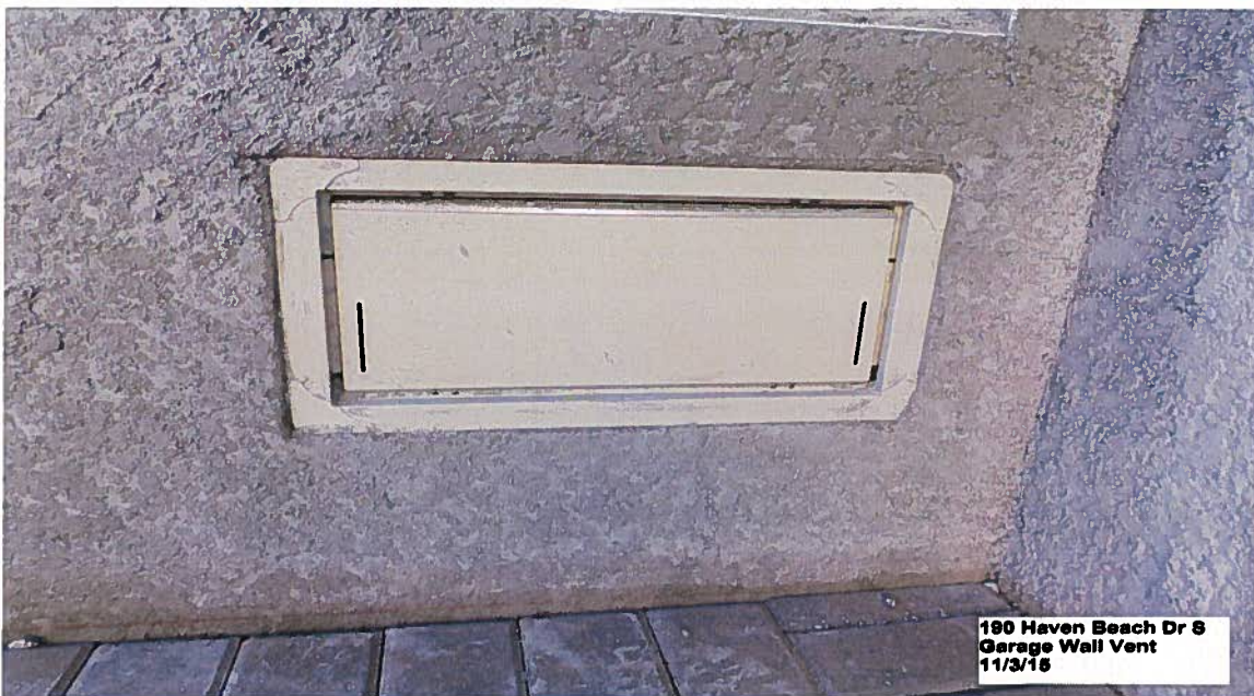
190 Haven Beach Dr S Garage Wall Vent 11/3/15