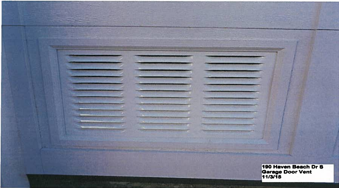
190 Haven Beach Dr S Garage Door Vent 11/3/15

If submitting more photographs than will fit on the preceding page, affix the additional photographs below. Identify all photographs with: date taken; "Front View" and "Rear View"; and, if required, "Right Side View" and "Left Side View." When applicable, photographs must show the foundation with representative examples of the flood openings or vents, as indicated in Section A8.