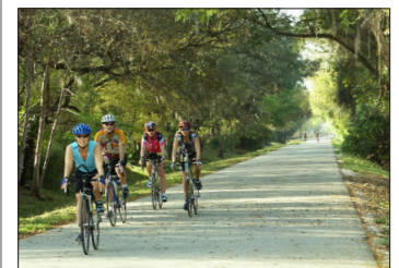
Fred Marquis Pinellas Trail