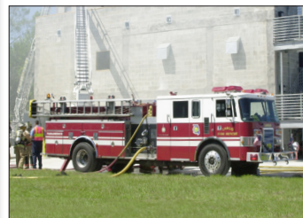
Fire and EMS Training Facility