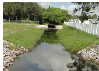
Lake Seminole Flood Protection